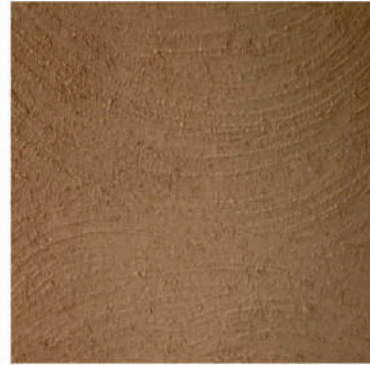
HP- WITH STRAW